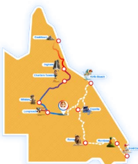
3. Journey across Australia